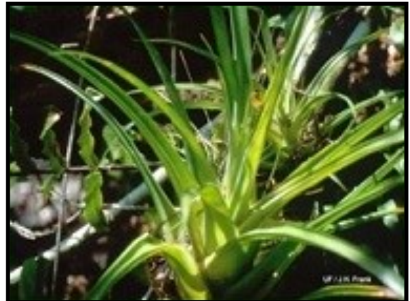
Catopsis Floribunda LB Sm Florida Strap Airplant