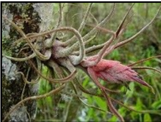
Tillandsia Pruinosa Sw Fuzzy Wuzzy Airplant