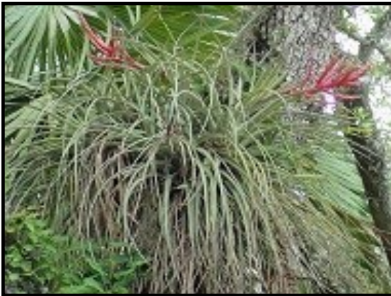
Tillandsia Fasciculata Sw Cardinal Airplant

Blossoms last from a few days to a few weeks with a whole combination of bright colors like pink and purple. After the plant flowers, snip off the flower, and it will keep on growing and producing more blooms.