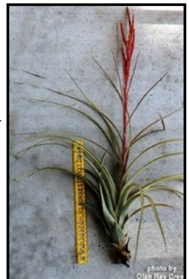
Tillandsia x Smalliana H Luther Crow's Nest