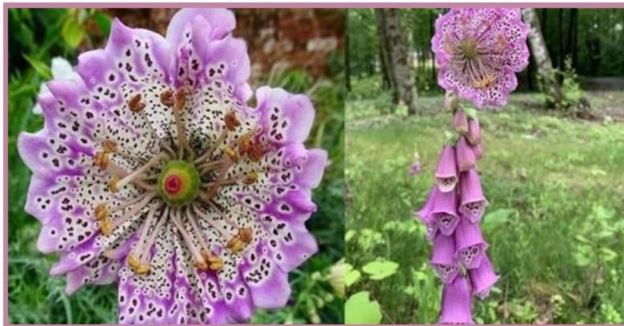
digitalis campanulata (foxglove)

be patient with yourself, good things take time