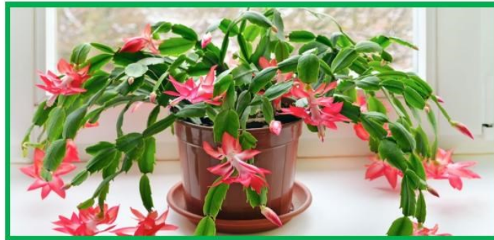
Leaves of the Thanksgiving cactus are toothed.

Thanksgiving cactus ( Schlumbergera truncata ) was once commonly called the "crab claw cactus" or "crab cactus" before it started being marketed around Turkey Day . It also goes by zygocactus . You can identify it by the pointy "teeth" on the sides of each stem segment. These teeth are soft, not sharp, and can vary in size, but are almost always visible on the plant to some degree.