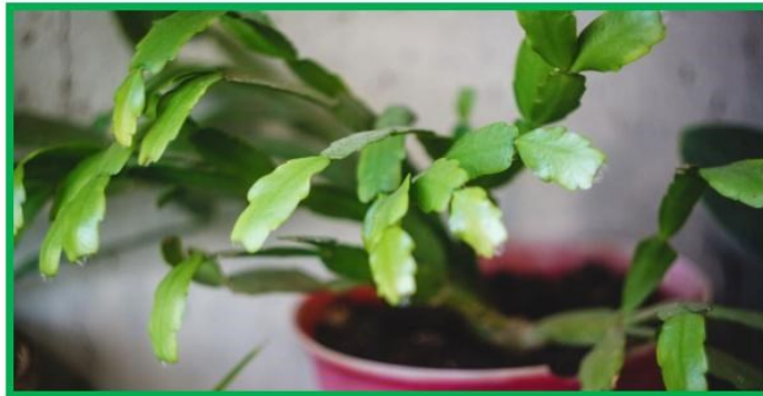
Christmas cactus leaves are rounded.

Christmas cactus on the other hand, comes from a species called Schlumbergera russelliana with some S. truncata or possibly a couple of other species mixed in. The resulting hybrid is known as Schlumbergera x buckleyi and can be hard to find for sale. Its stem segments lack pointed teeth, with more scalloped or rounded edges.