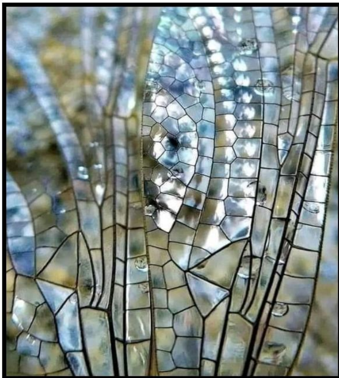
Dragonfly wings up close. Nature is amazing.