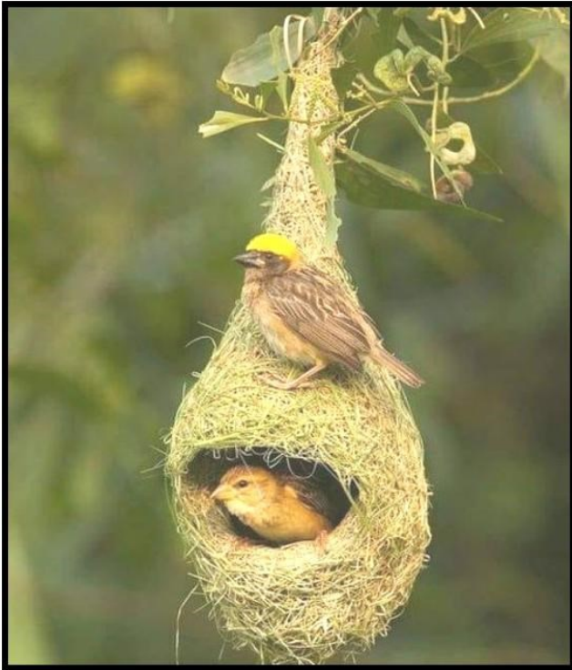
Architects Without A Degree!