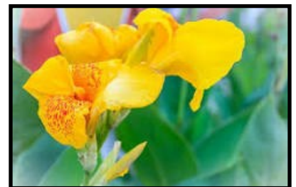
Golden Canna Lily

As you can see, most of these plants love water, but if you don't live by a canal or lake, you can grow some of these in small tubs. Please be sure to google them to see their requirements. I am sure either Kristen (248-933-1069) or Pilar (954-854-9757) would be happy to answer any questions you might have. Let's help get more native plants out there!